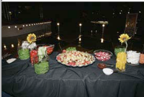
'70s fare provided by Marks Catering