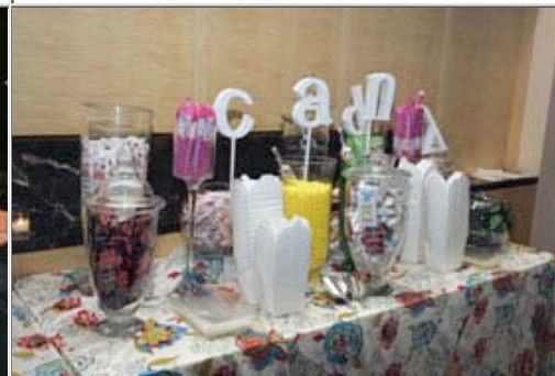
Nostalgic '70s treats from yoursweettooth.com. Pixie Sticks, candy mecklaces and pop rocks... oh my!