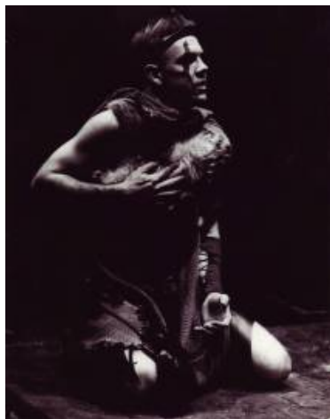
As Macbeth at Northwestern University